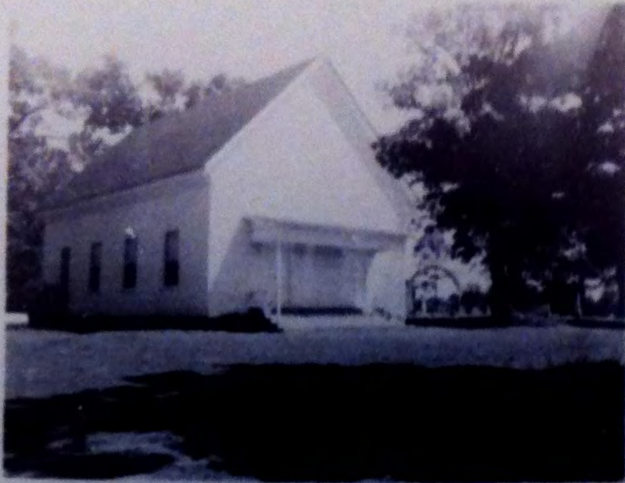
LaGrone's Chapel Harrison County