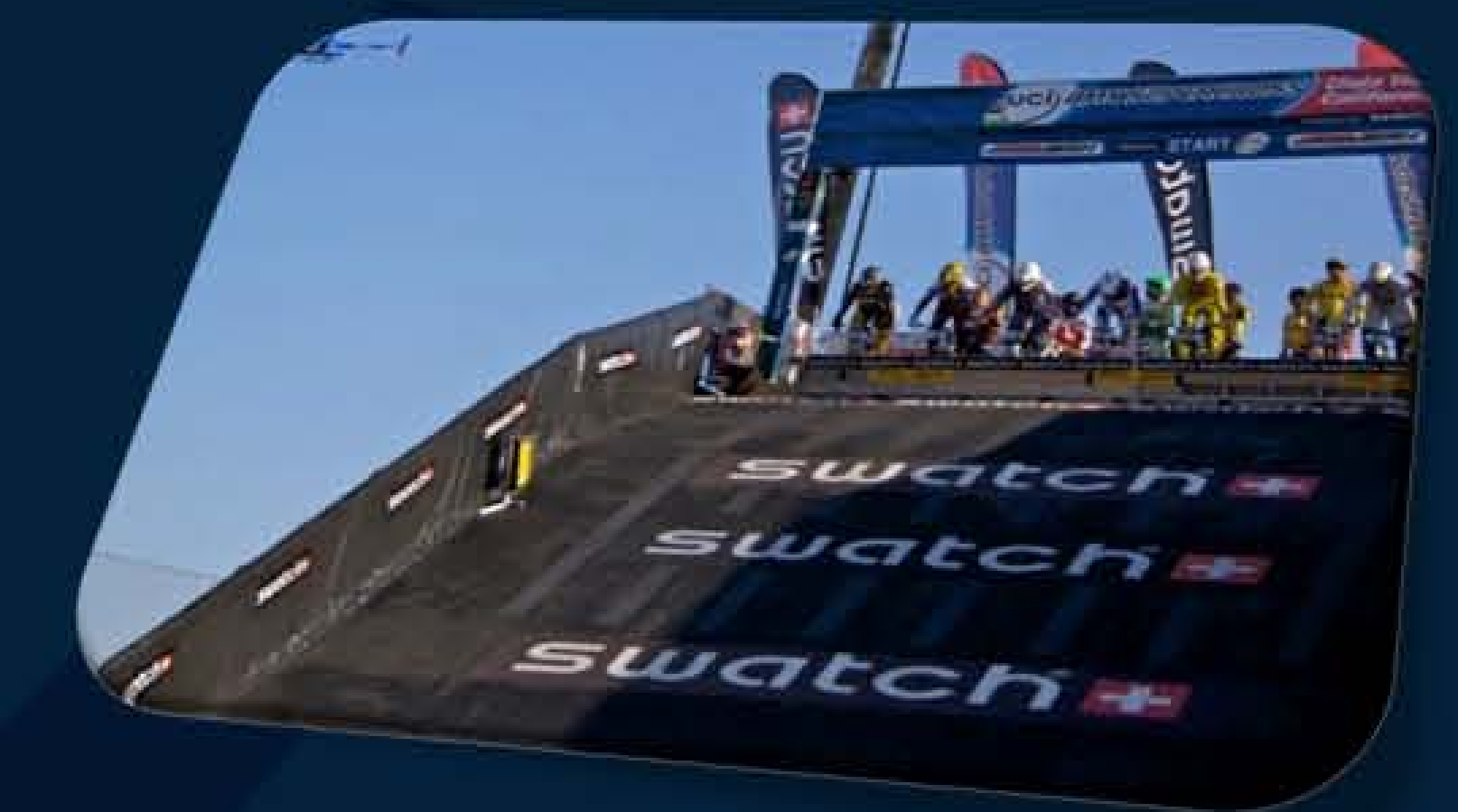
Union Cycliste Internationale BMX Supercross World Cup Competition included 140 Elite men and 32 Elite women from 21 countries. September 17-19, 2010