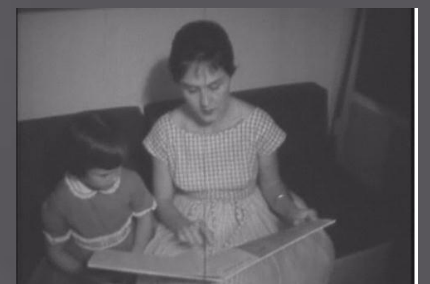
A still from the short film: Target: Austin, TX

Provided with 3 articles on the paradox of civil defense in the 1950s, I analyzed the hypotheses of three scholars and tested their hypotheses by analyzing primary sources, such as articles, short films, songs, etc. In doing so, I was able to better understand the psychological effects war has on our nation.