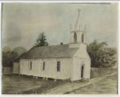
Christ Episcopal Church in San Augustine, TX