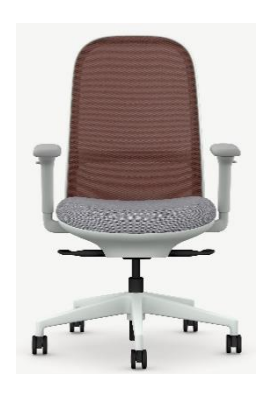
2D Height Adjustable Arms