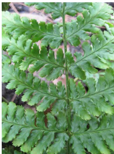
Dryopteris xxx in the Shade Garden

One might not think that talk of agaves would make a good segue into a conversation about ferns, but in this case it does! In our ever expanding fern collection, we've amassed a good number of full sun drought tolerant ferns, mostly from the genus Cheilanthes . These heat lovers have found a home in the old Rose Hill with agave, palms, and some new varieties of Dianella , or flax lily. In addition to this collection, we're creating areas in the shade garden for specific collections. Currently, we have a wonderful display of Dryopteris - Wood Fern - soon to be joined by beds of Polystichum - Shield Fern, Thelypteris - Maiden Fern, and Athyrium - Lady Fern, plus a few one-of-a-kinds.