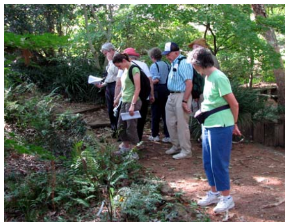
HHF members view ferns in the arboretum collection

Most important to our end of the garden world is that the Mast Arboretum and PNPC get the chance to be involved in a project that promises to preserve the germplasm of antiviral ferns and fern allies through the creation of two fern gardens: A preserve of native medicinal ferns and fern allies at the Pineywoods Native Plant Center and a collection of promising exotics in the Mast Arboretum and Ruby M. Mize Azalea Garden.