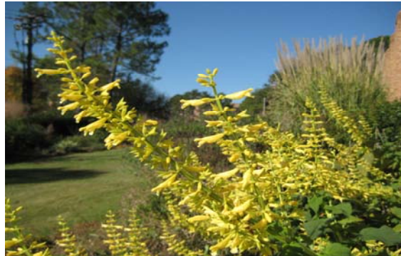
Salvia madrensis in bloom in the perennial borders at the Arboretum

Two cultivars are somewhat common, 'Dunham' which is reportedly hardy to 9 degrees F, and 'Red Neck Girl' which sports red stems and an earlier bloom period. You'll find the species at the Arboretum plant sale next year on April 12th!