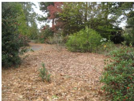
Bare grounds eagerly awaits new plants

The asphalt portion of our trails is completed and we're been busy blending them into the garden, or rather blending the gardens into them. In other words, we're making the beds bigger and have tons more space for plants!