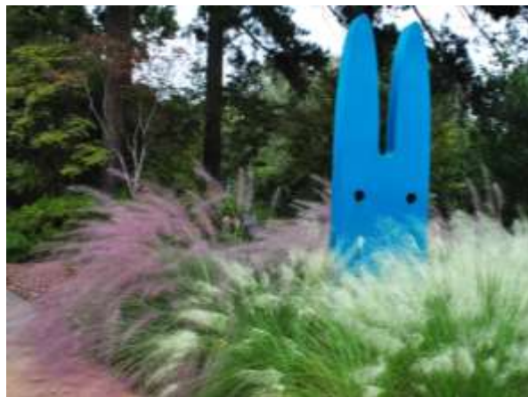
Bunny, sculpture by Jeff Brewer, is surrounded by 'White Cloud' and 'Pink Flamingo' muhly grasses.

So many treasures, so little time. I can't wait to find the hidden gems only the passing seasons can uncover! As I write, the fiery side of fall is making itself known. If only for a fleeting moment, we're given a glimpse into the softer, prettier-in-pink side of Mother Nature. Cherish all that she offers!