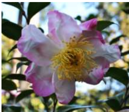
A lovely blossom of Camellia 'Hana Jiman'

Camellias, especially sasanqua selections and hybrids, begin their sweet song as the weather turns hospitable once more. Sasanqua camellias come in many shades of pink as well as white and the brick red of 'Yuletide.' 'Hana Jiman' is a free flowering Camellia sasanqua with a great overall habit and many