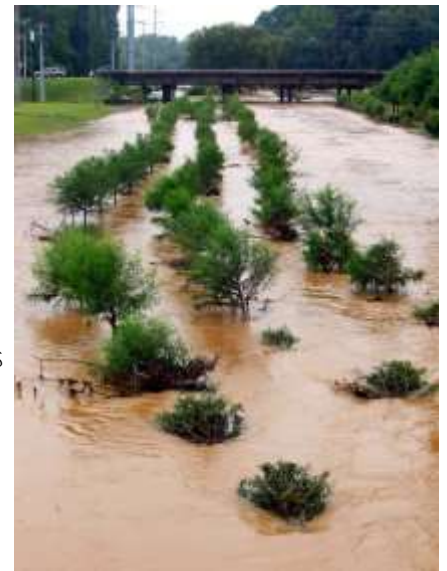
The LaNana Creek leaves its banks, flooding the Taxodium collection.

The Fall Festival Plant sale was perfect. Perfect