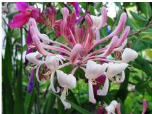
'Pam's Pink' honeysuckle blooms with Byzantine gladiolus.

I gave a talk recently and afterward was asked the usual question of where they could obtain all the neat old fashioned plants that I had shown and praised. The lady said,