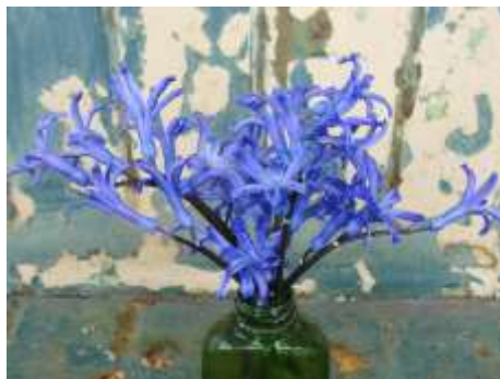
Blue Roman hyacinths in an antique jar

Like everything else in life, the best plants belong to those that work the hardest to get them. A case in point: I got a tiny cutting of