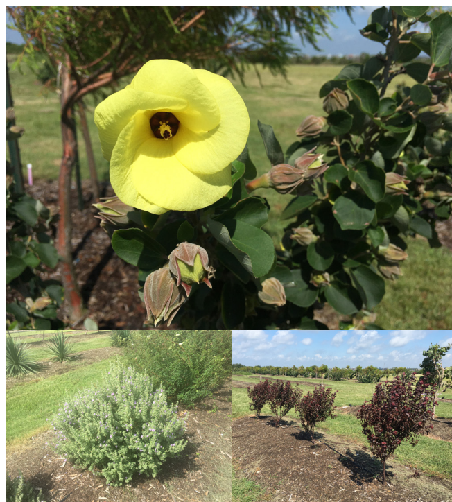
Clockwise from top: Hibiscus hamabo , SFA's Prunus X 'Purple Pride' and Leucophyllum langmaniae 'Lynn's Legacy' brave the challenging environment in Galveston.

I've come to love our Moody Gardens project. Everyone I've met on the island is quick to let me know we're one hurricane away from a disaster. But this is Galveston, and the islanders know that. Our project is not for the timid. It's an effort that can help us gain a better understanding of how to deal with plants in a challenging environment. Finding climate-change-friendly plants and better strategies to grow them is indeed a noble cause.