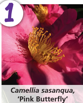
Camellia sasanqua , 'Pink Butterfly'

Winter can be gray and sad. The sky is gray, the trees are bare, and most of our flowers are hiding dormant underground. But a walk through our gardens will show that not everyone is sleeping! Our camellias are showing off right now. Camellias are known as the tea plant. They are native to Asia, China and Japan, but they are well adapted here. We know them as evergreen shrubs or small trees that become covered in flowers. Camellias grow best in part shade under our trees where they are protected from high winds and our blazing Texas heat. Most species of camellia prefer moist, well-drained, slightly acidic soils. There are many species of camellia. Here are a few of the great ones.