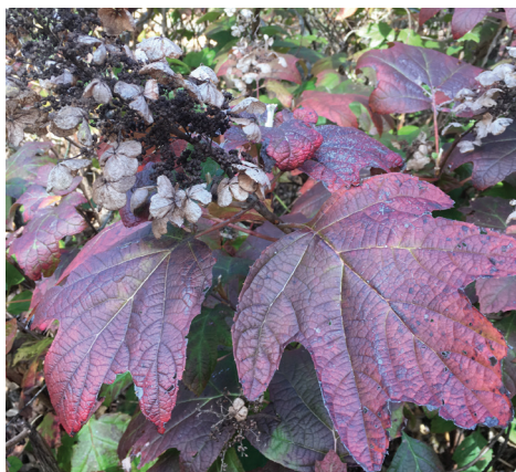
Oakleaf hydrangea, Hydrangea quercifolia

The show will be over by the time this newsletter reaches you, but you can mark your calendars for Thanksgiving of next year with a reminder to start looking out for the colorful foliage in the SFA gardens. In the meantime, our camellias are coming into season, so there are still plenty of beautiful reasons to visit the garden. I’ll see you around!