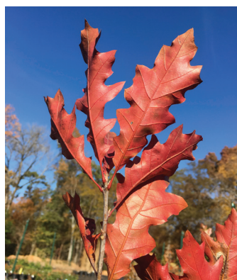
Shumard oak, Quercus shumardii