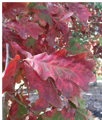
White oak, Quercus alba

It may seem odd reading about fall color in the winter newsletter, but when “fall” color occurs on the cusp of November and December in the SFA gardens, it's not too far from the mark. Every year, beginning in late September and early October, I get calls, emails and Facebook messages asking about the timing of the gorgeous fall color in our gardens. I'm often met with incredulity and doubt as my answer is always, “after Thanksgiving.” It's often well into December before we're graced with the explosion of color when our foliage reaches its potential.