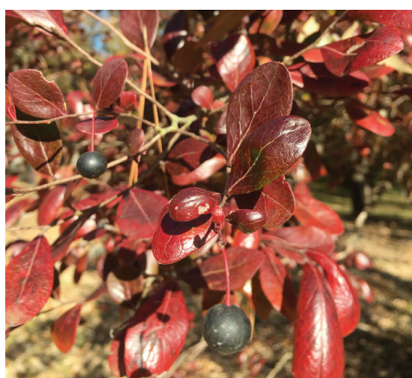
Farkleberry, Vaccinium arboreum