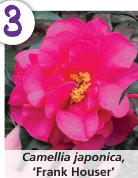
Camellia japonica , 'Frank Houser'

few in the shade garden at SFA. The flowers are small, single white blossoms with a yellow center. I had heard rumors about the fragrance of these little blossoms, but I had to smell them for myself to be sure. The flowers of Camellia sinensis smell just like fresh, warm tortilla chips!