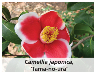
Camellia japonica , 'Tama-no-ura'