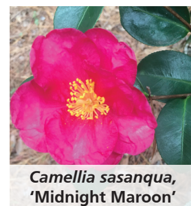
Camellia sasanqua , 'Midnight Maroon'