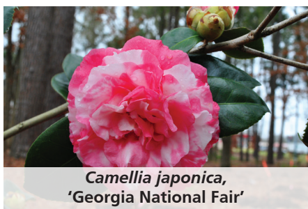
Camellia japonica , 'Georgia National Fair'