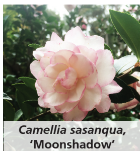
Camellia sasanqua , 'Moonshadow'