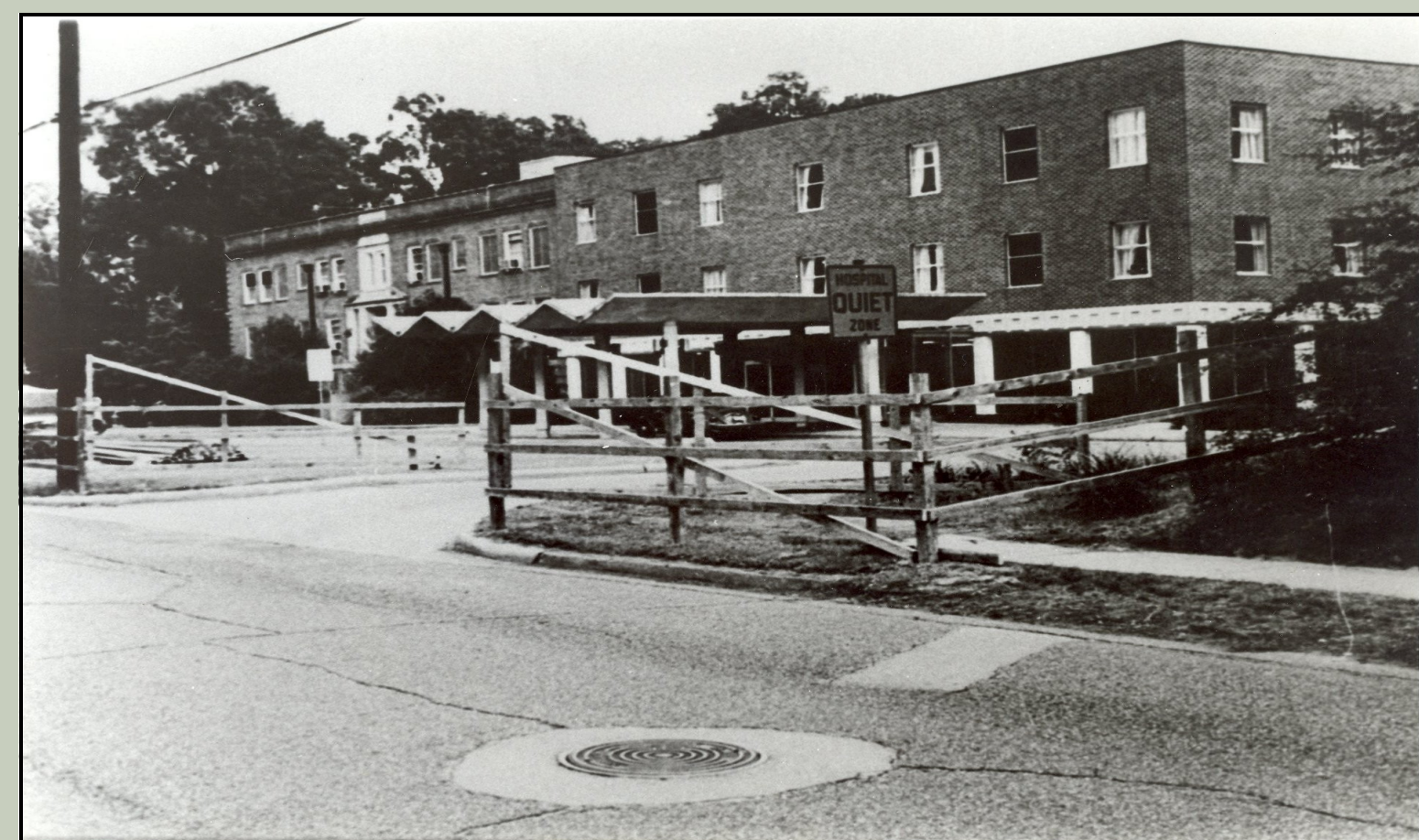
The hospital with a new addition Circa 1950.

The growth of Nacogdoches caused the hospital to expand to accommodate a higher population. Over the next several decades, the hospital received several renovations and additions, and by the 1960s, little of the original hospital remained.