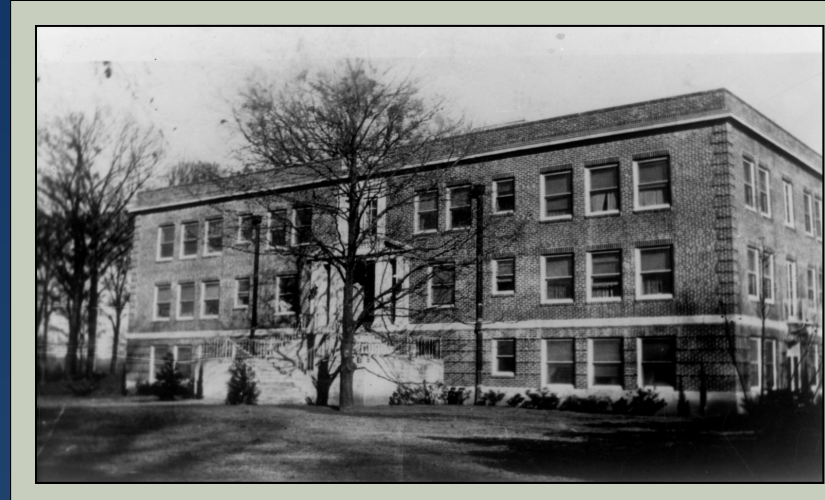
The original hospital building in 1928

On a cold December day in 1928, an anxious crowd gathered to witness the opening of city's first hospital. Built on land donated by the Blount family, the City Memorial Hospital brought comfort to Nacogdoches, and the surrounding counties, with the promise of modern healthcare.