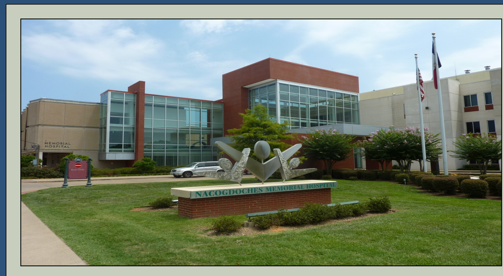
The front entrance to the Hospital. 2013