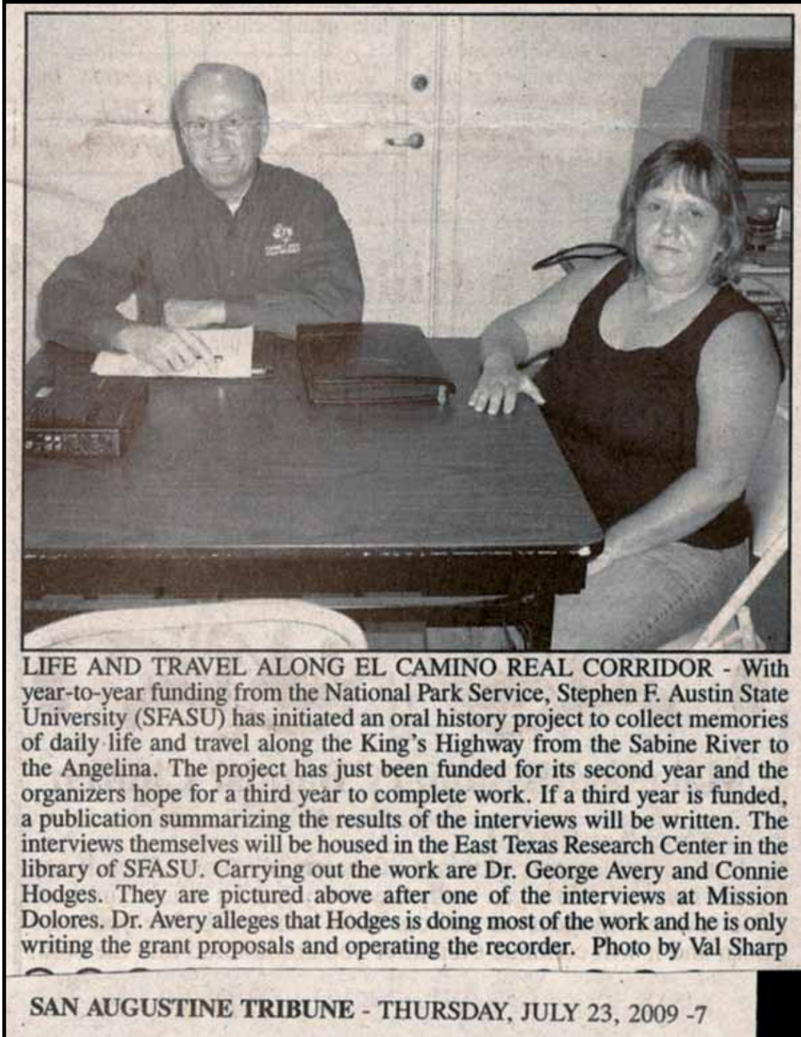
Figure 6. Newspaper article about the project.