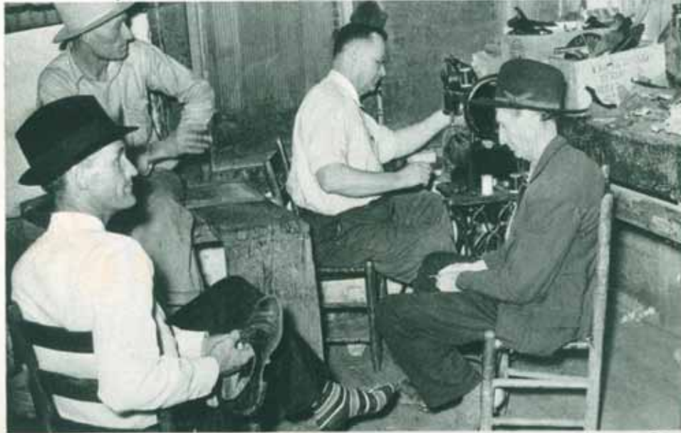
Shoe Repair, San Augustine, Texas