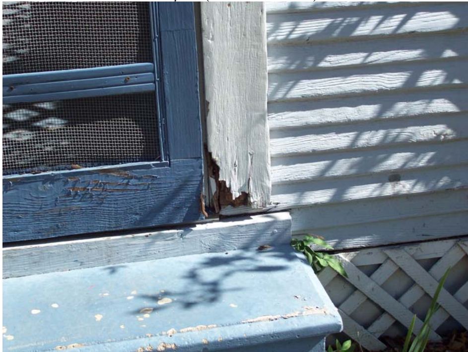
Figure 17.3: Wood rot near doors on enclosed porch on Western Façade (taken 11/7/2008)