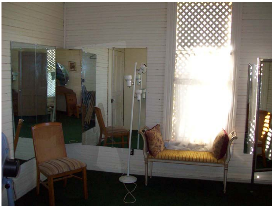
Figure 13: Back Room (taken 11/7/2008)