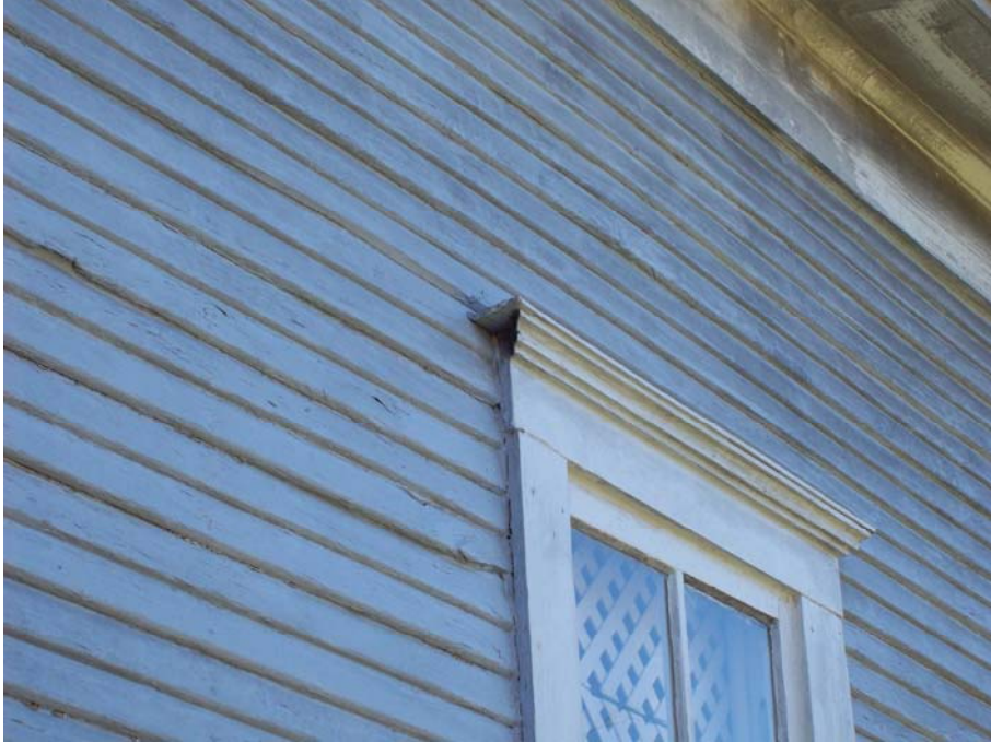
Figure 14.3: Damage to molding over right most window on Northern Façade (taken 11/7/2008)