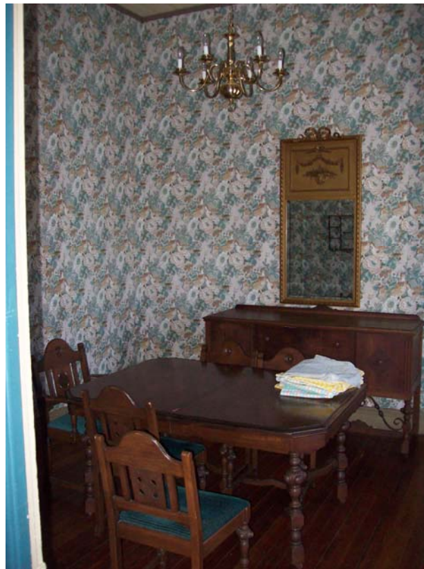
Figure 11: Dining Room (taken 11/7/2008)