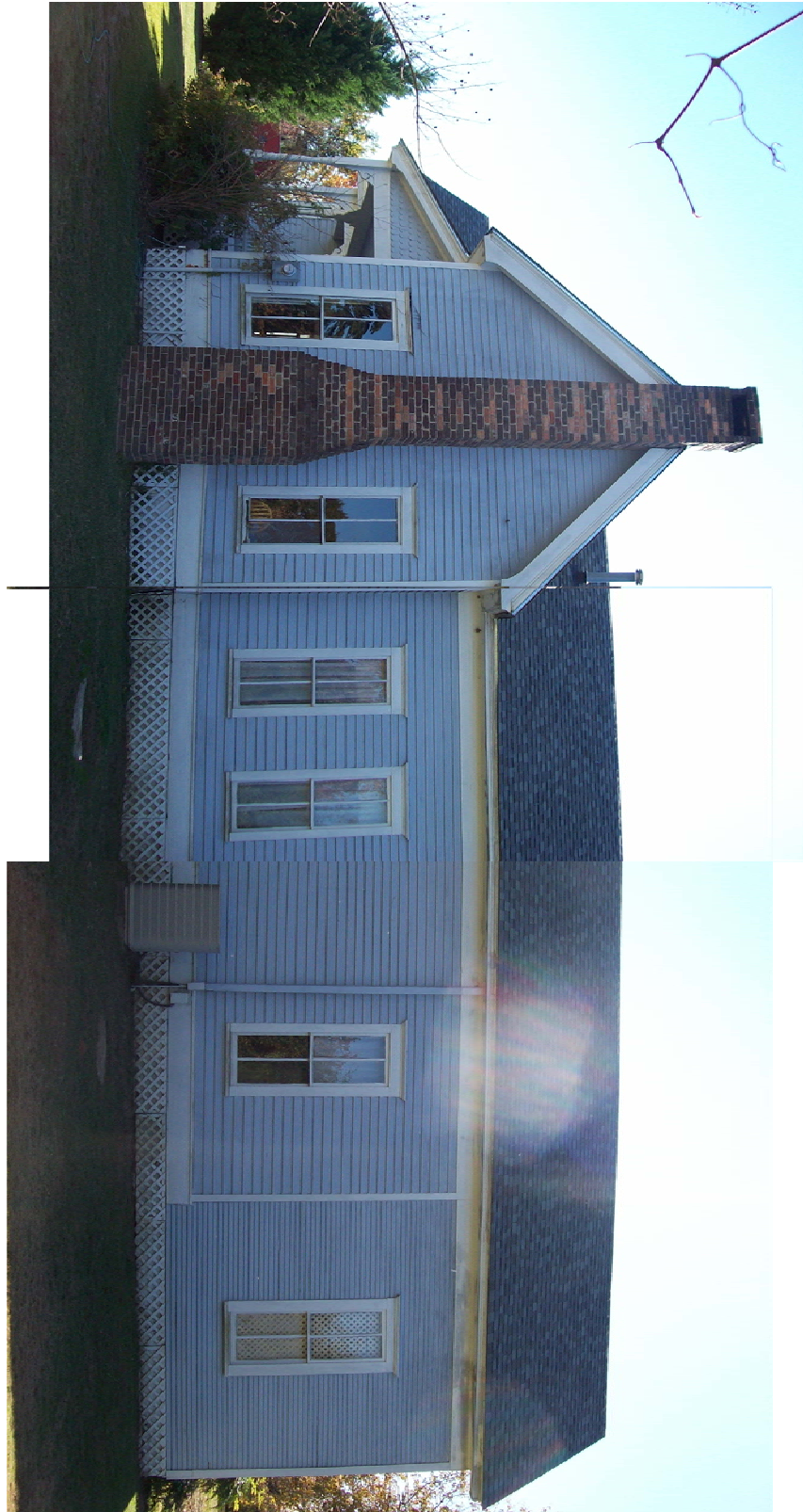
Figure 2: Northern Façade (taken 11/7/2008)