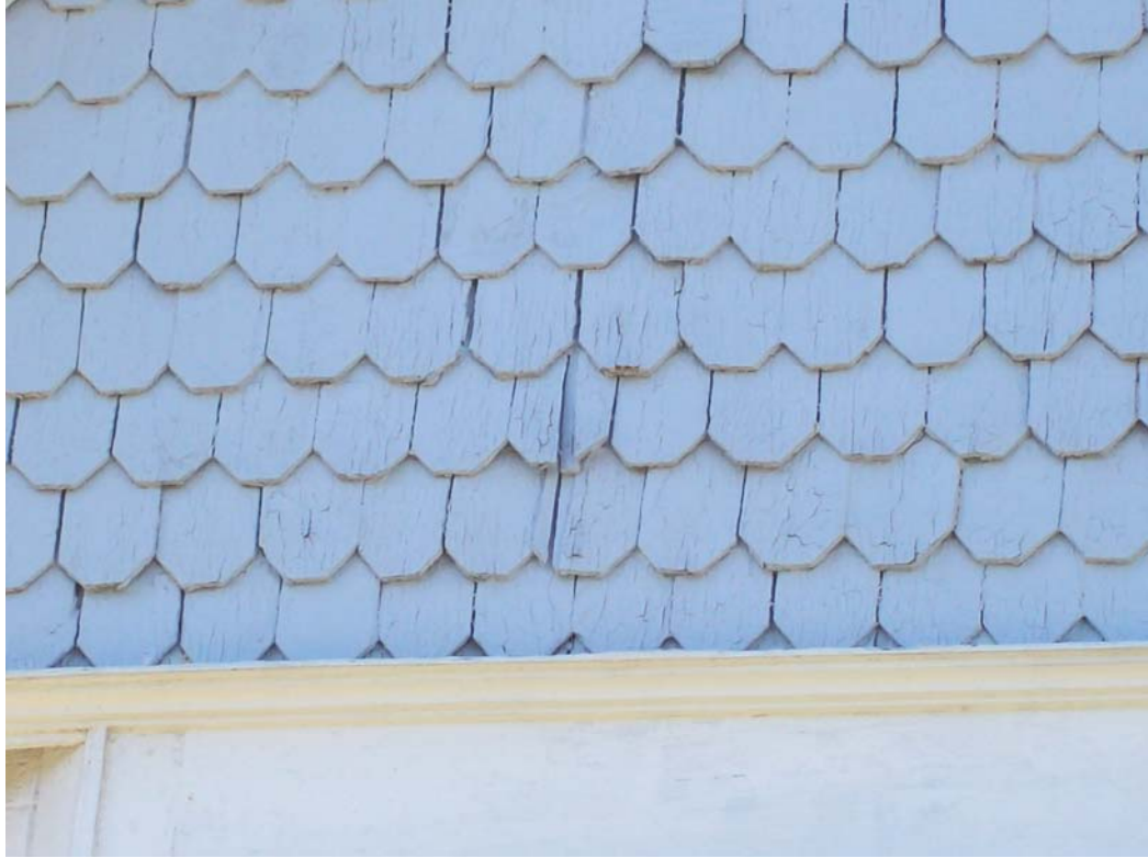
Figure 16.1: Damage to Wooden Shingles under Bay Window on Eastern Façade (taken 11/7/2008)