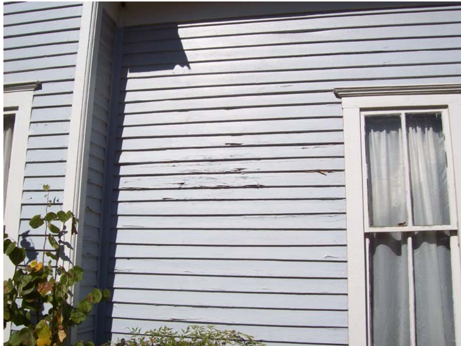
Figure 15: Damage to Wooden Paneling on Bay Window of Southern Façade (taken 11/7/2008)