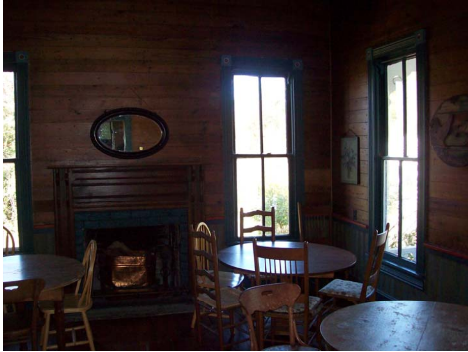
Figure 10: Back Parlor (taken 11/7/2008)