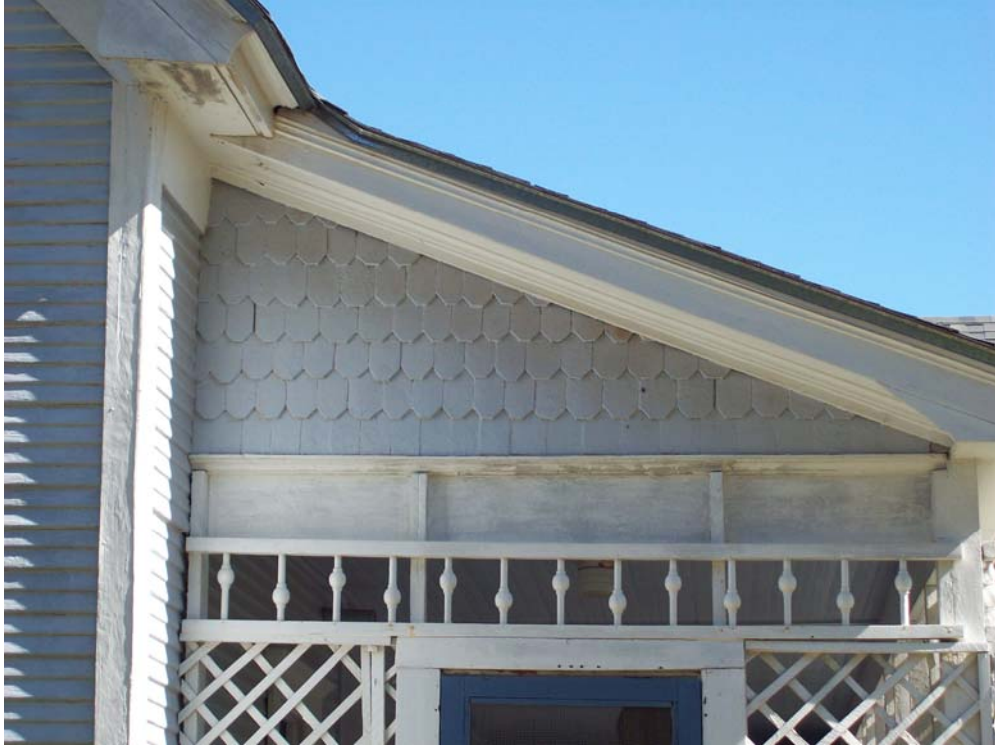
Figure 17.2: Damage to eaves and trim on shed roof over enclosed porch on Western Façade (taken 11/7/2008)