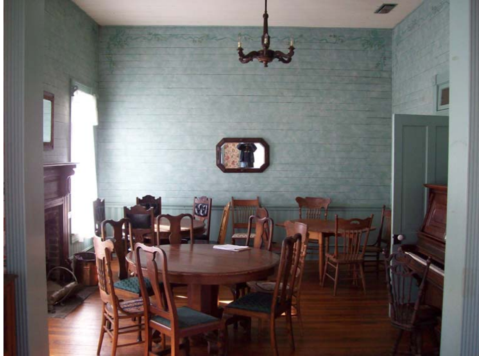
Figure 8: Front Parlor (taken 11/7/2008)