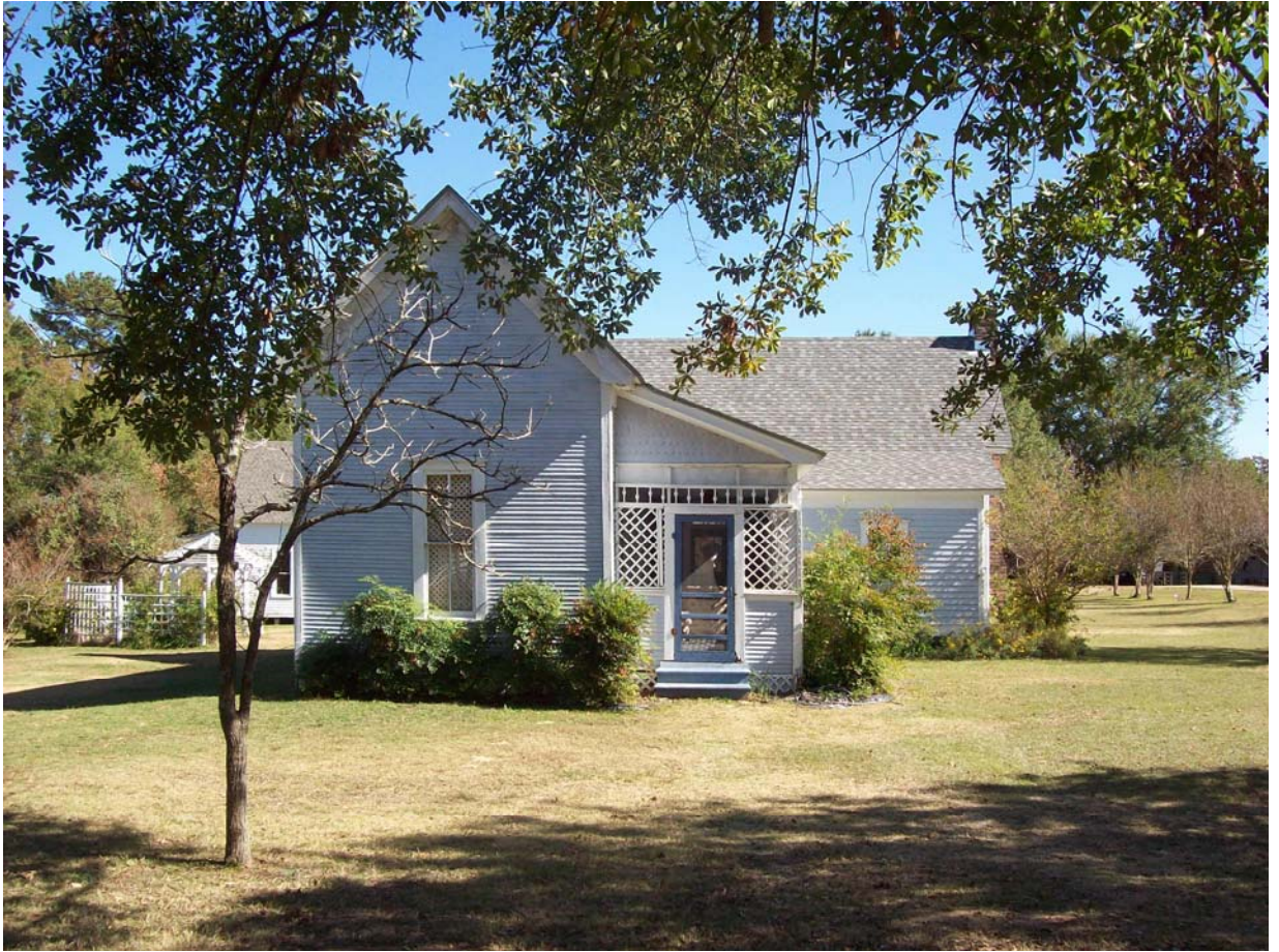
Figure 5: Western Façade (taken 11/7/2008)