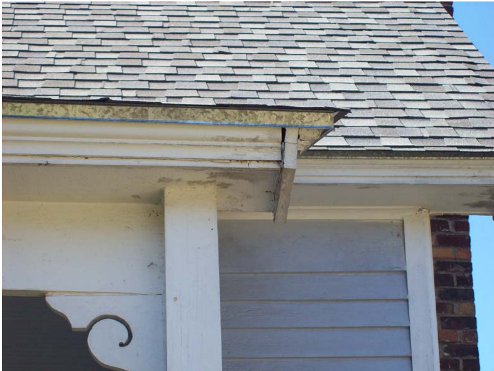
Figure 16.2: Damage to eaves above porch on Eastern Façade (taken 11/7/2008)