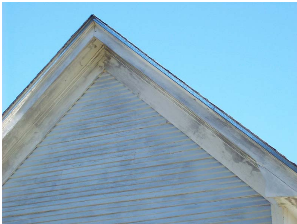
Figure 17.1: Damage to eaves on gabled wall on Western Façade (taken 11/7/2008)