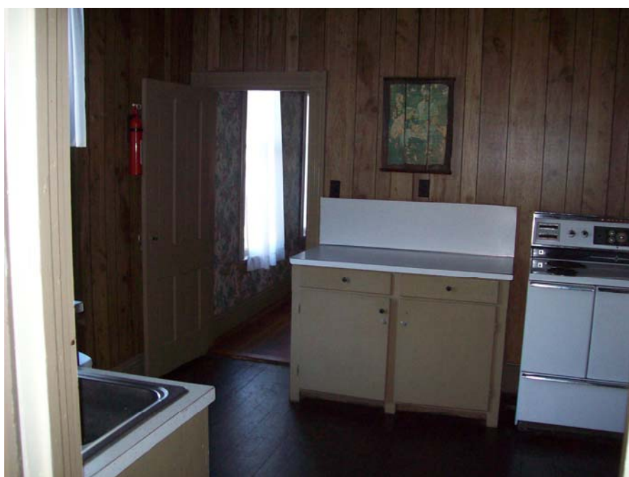
Figure 12.2: Kitchen (taken 11/7/2008)