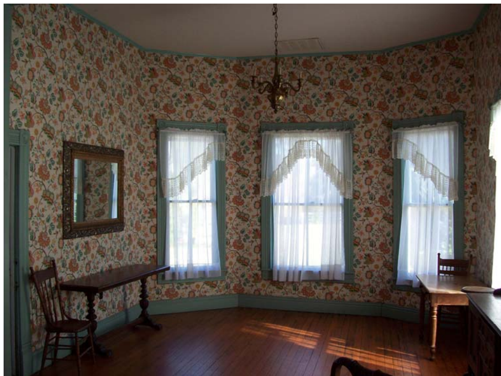
Figure 9: Bay Window Parlor (taken 11/7/2008)