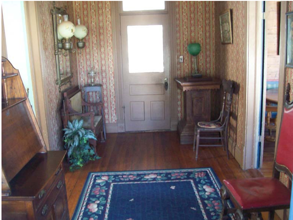
Figure 6: Entry Room (taken 11/7/2008)