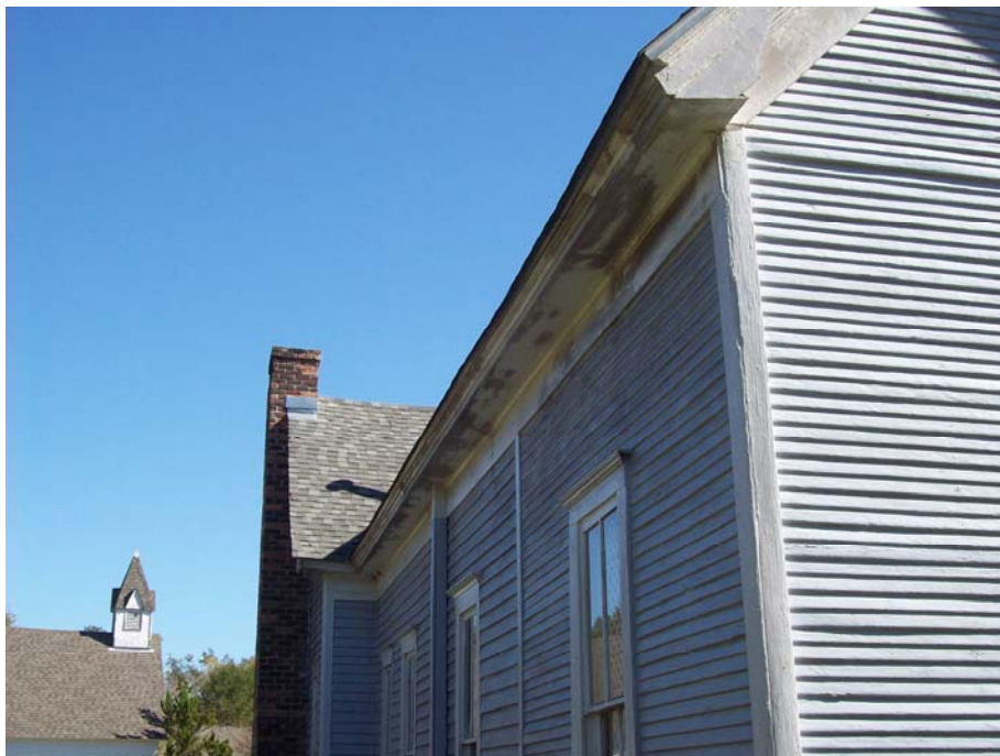
Figure 14.1: Damage to Eaves on Northern Façade (taken 11/7/2008)