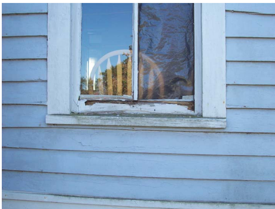
Figure 14.2: Damage to Window right of Chimney on Northern Façade (taken 11/7/2008)