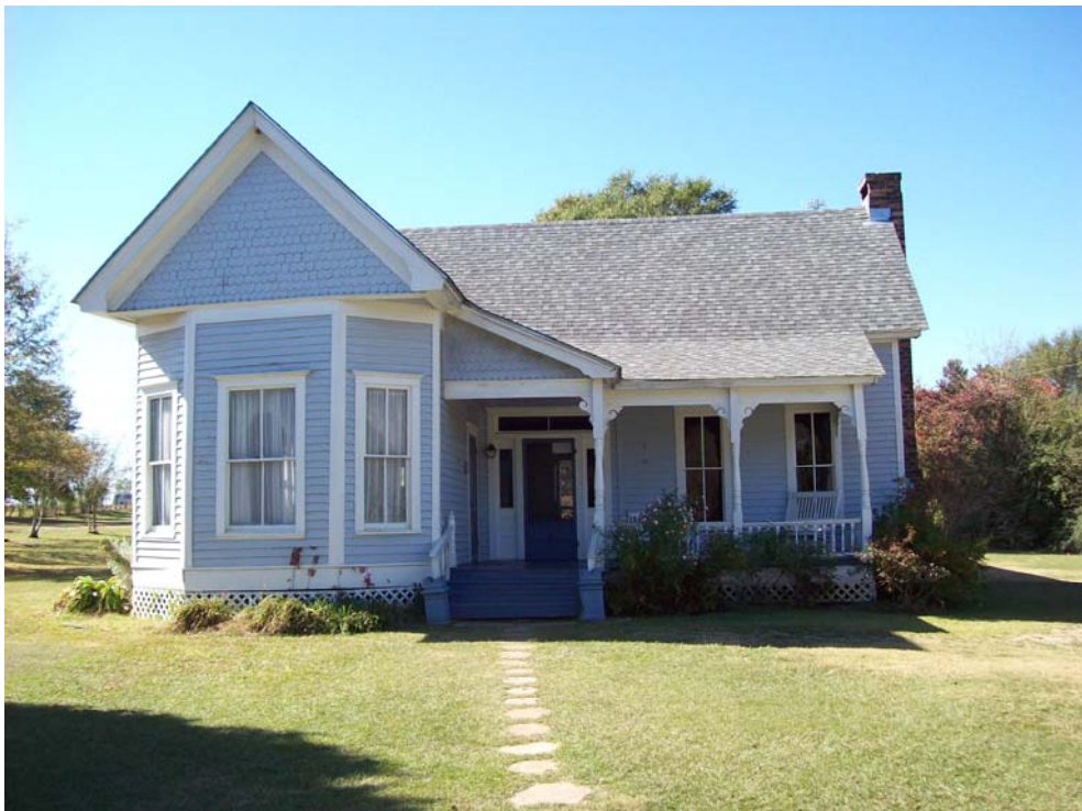
Figure 4: Eastern Façade (taken 11/7/2008)