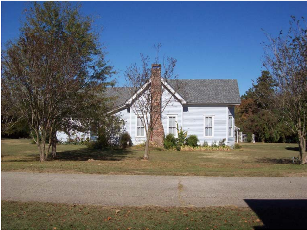
Figure 3: Southern Façade (taken 11/7/2008)