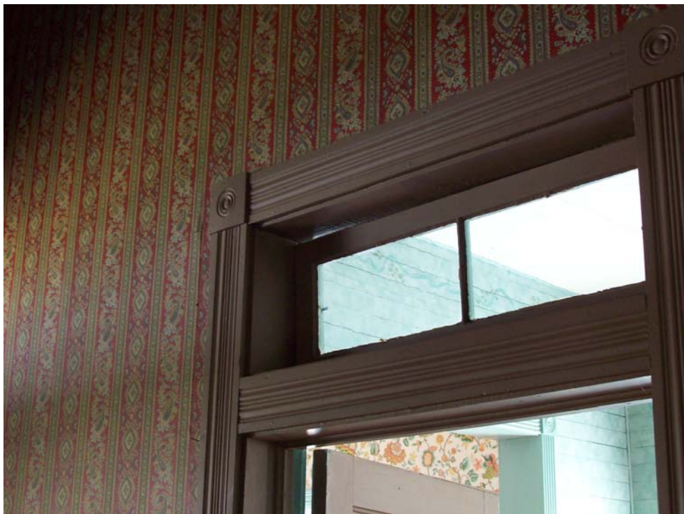
Figure 7: Pivot Window above door in Entry Room (taken 11/7/2008)