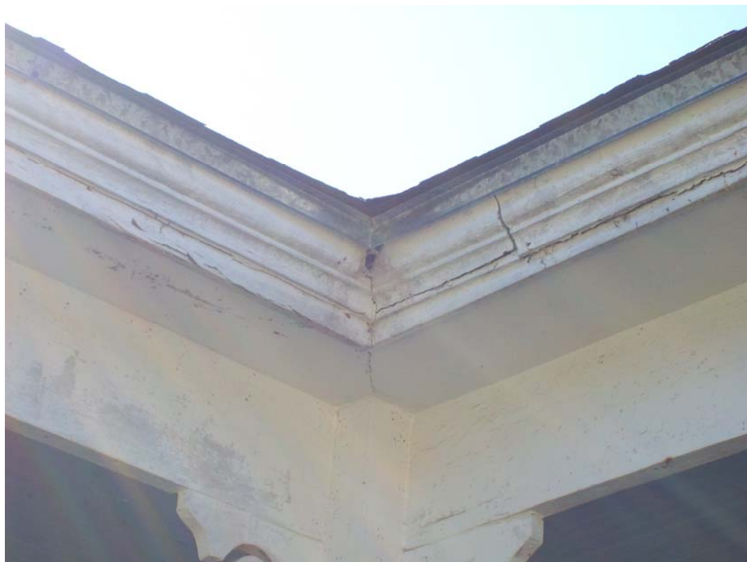
Figure 16.3: Damage to eaves above porch on Eastern Façade (taken 11/7/2008)