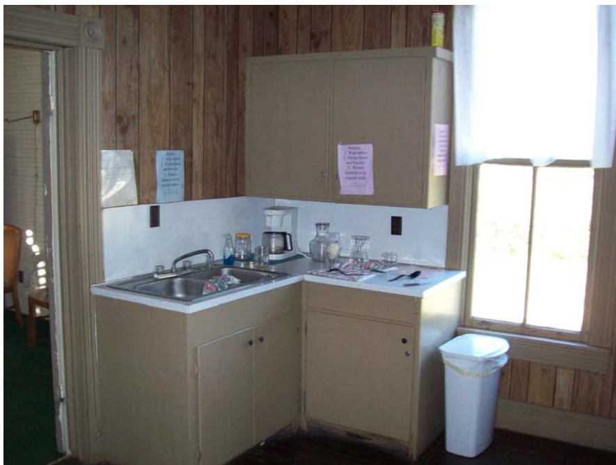
Figure 12.1: Kitchen (taken 11/7/2008)