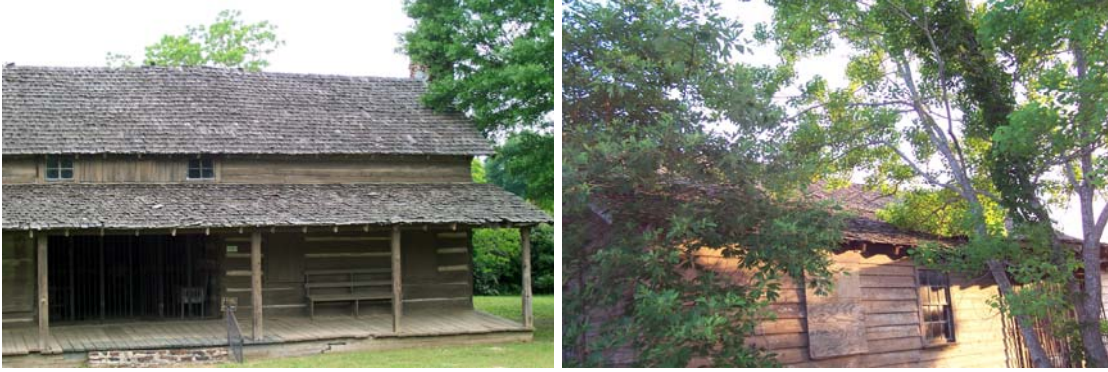
Figure 2.5 shows the tree on the right side of the picture with branches extending over and touching the roof of the building. Figure 2.6 shows the tree on the North side of the building. This can cause damage during severe weather, and trap moisture on the wooden shingles, which will lead to mold and fungal rot on the roof.