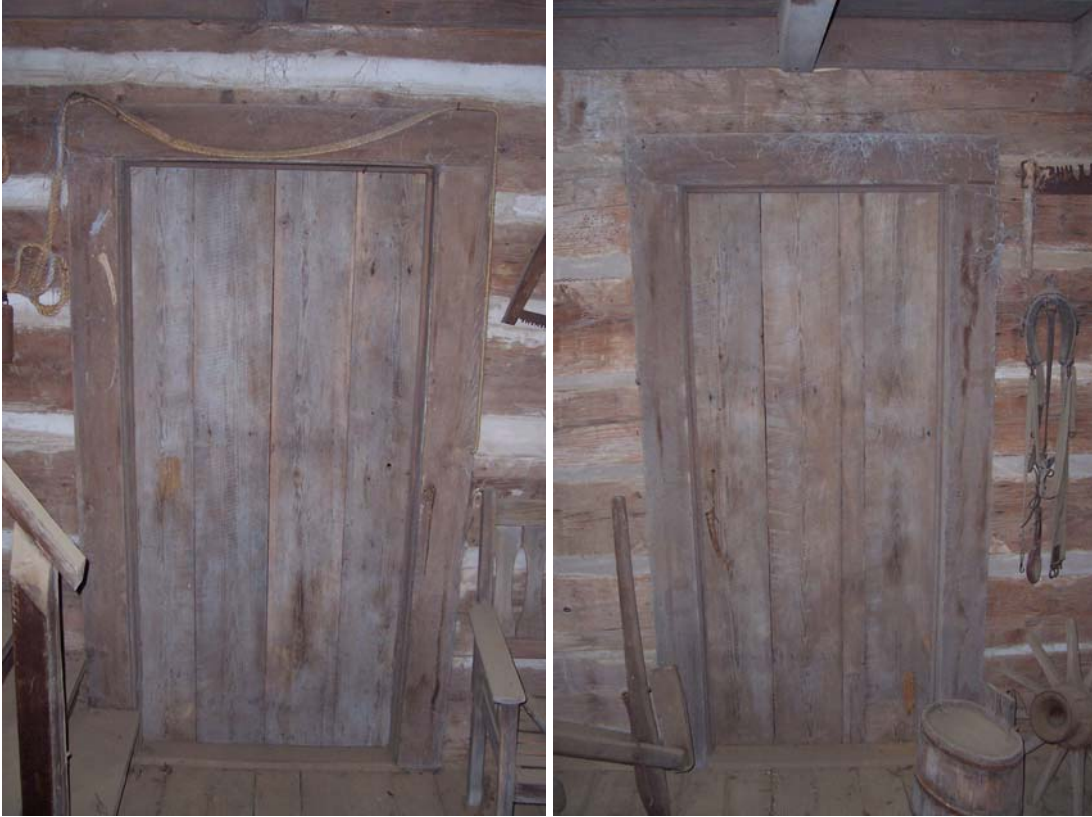
Figure 9.1 shows the east side entrance and figure 9.2 shows the west side entrance. Both doors are in good condition and fit the historic feel of the house