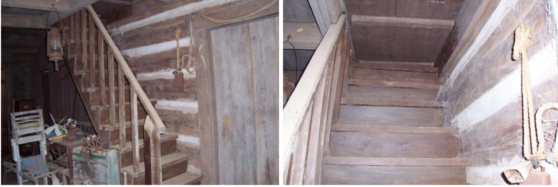
Figures 12.1 and 12.2 show the stair case that is located in the space way. You can see that the stairs are sealed off and no longer used, but they appear to be in the original location.