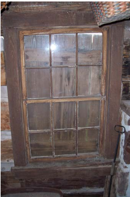
Figure 10.1 shows the style of window on the first floor. All 14 windows on the first floor are exactly like this one.

Figure 9.4 shows that the interior doors leading to the dogtrot's main rooms are of the same style as the doors that lead into the addition. All three doors look like the one shown.