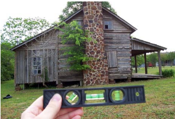
Figure 2.1 shows the grade of the land sloping from the front to the back of the building.