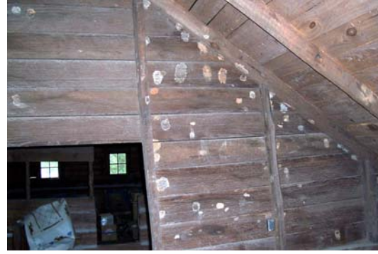
Figures 4.8, 9 and 10 show the extensive white rot along the interior of the roof. White rot can be seen on the sheathing, rafters and the partition walls of the second floor.