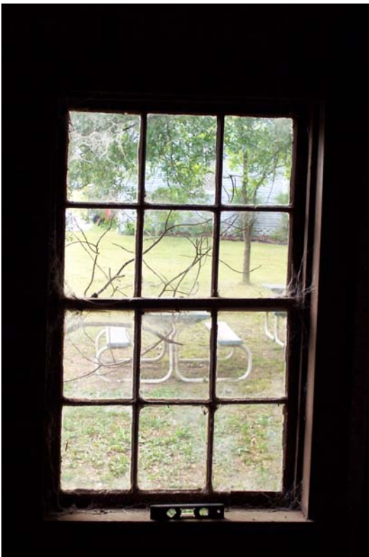
Figure 1.10 shows a view from east side inside the rear addition. The window is slanted towards the rear of the building.