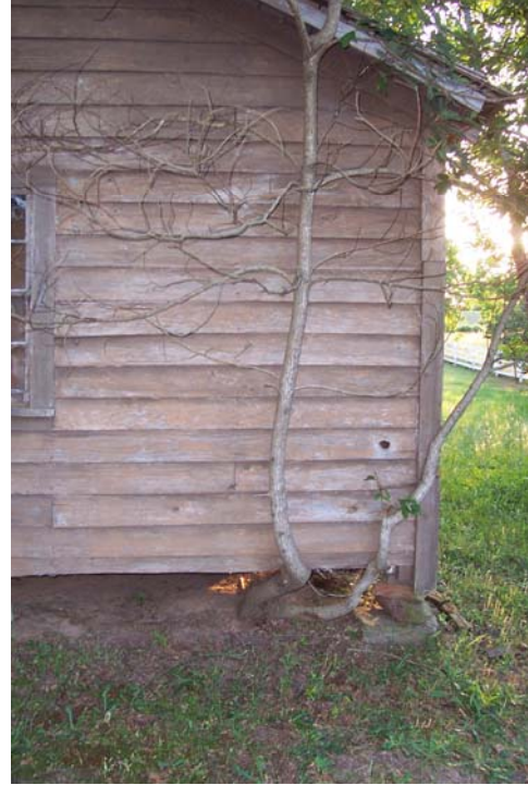
Figures 2.2 and 2.3 show trees growing from underneath the house.