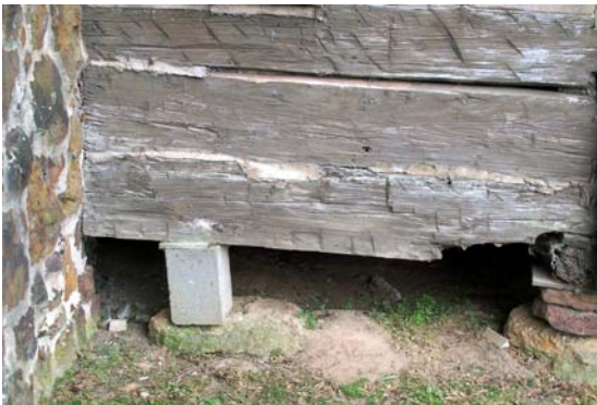
Figure 3.4 shows a cinder block being used as support and a distinct lean to the pillar causing uneven pressure on the support.