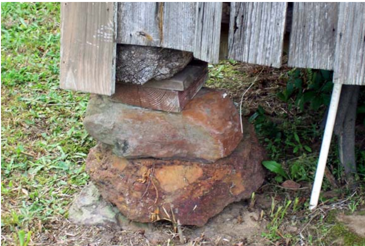
Figure 3.1 shows the stone pillars that support the building. In this picture you can see that three pieces of wood are used on this support. The wood is also splitting and can possibly fail from the weight bearing down upon it and puts the entire structure in danger of collapsing if the wood should fail.

Figure 2.5 shows the tree on the right side of the picture with branches extending over and touching the roof of the building. Figure 2.6 shows the tree on the North side of the building. This can cause damage during severe weather, and trap moisture on the wooden shingles, which will lead to mold and fungal rot on the roof.