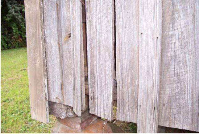
Figure 1.11 shows the large gaps in the siding of the rear addition, through which the interior can be seen.