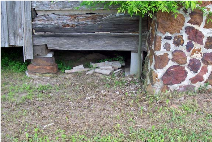
Figure 2.4 shows the base of the smaller tree growing along the west chimney. This tree can also be seen in figures 2.1 and 1.3.