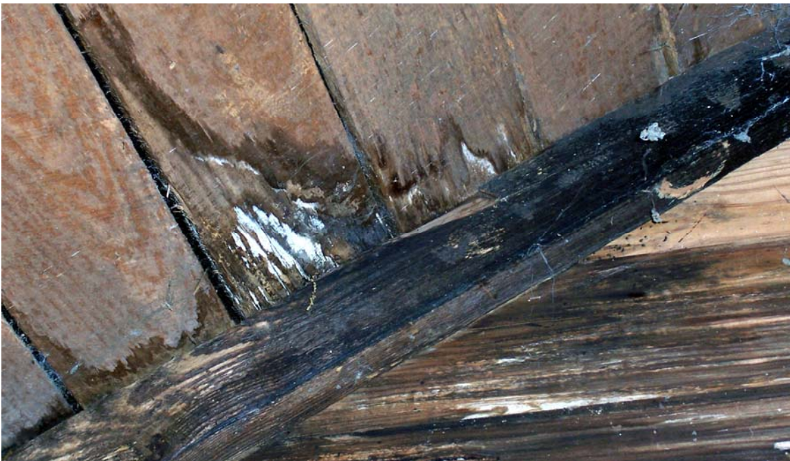
Figure 1.8 (below) shows the significant water damage that is occurring in the roofing materials. This shows damage to the sheathing and rafters and extensive black rot.

Figures 1.5, 1.6, and 1.7 (above) reveal the light that shines through the peak of the roof where separation is occurring. The two sides of the roof are pulling apart from each other.