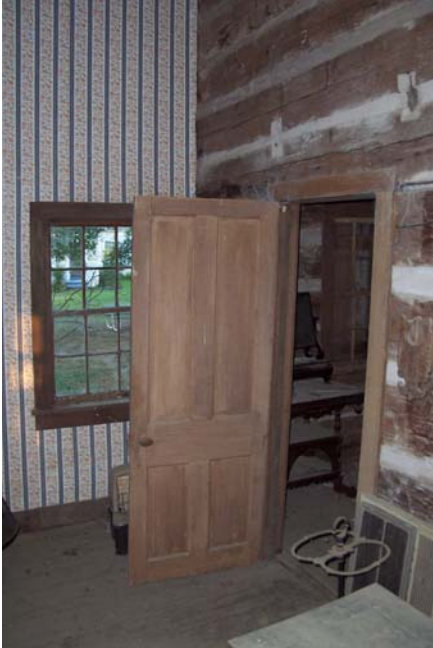
Figure 9.4 shows that the interior doors leading to the dogtrot's main rooms are of the same style as the doors that lead into the addition. All three doors look like the one shown.