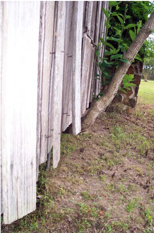
Figure 1.4 displays evidence of the siding on the rear addition of the building coming off.