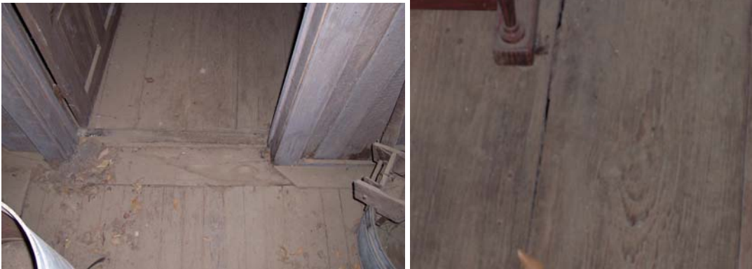
Figures 13.2 and 3 show the flooring in the west side, and one can see the gaps and cracks in the flooring. Looking closely at Figure 13.2 the threshold has a cracked section. This section is not secured and if you were to put weight on it you would fall through the floor.