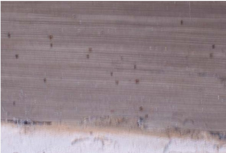
Figure 6.2 shows another location along the east side that shows signs of powder-post beetles. These holes can be found throughout the entire structure.