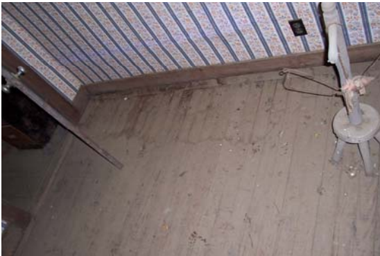
Figure 13.1 shows the flooring in the east side rear addition. The water damage is clearly evident along the north wall flooring and the threshold.