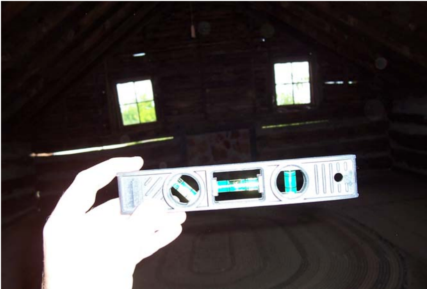
Figure 1.9 reveals the slant towards the rear of the house. This is the west side of the building and the window on the left is slanting towards the rear of the building.