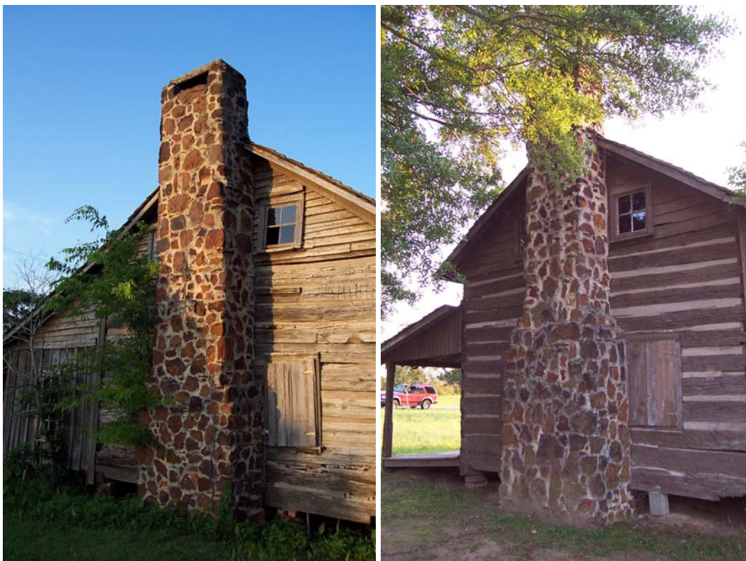
Figure 7.1 shows the chimney on the west side of the building, and figure 7.2 shows the chimney on the east side. Both chimneys are in good condition as are evident from the pictures. However, note the vegetation on the west chimney in figure 7.1. A tree is growing along the north side and a vine is growing up the chimney on the north side. These need to be removed.