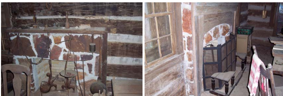
Figure 8.1 shows the fireplace in the west side front room. Figure 8.2 shows the fireplace in the east side front room. They are both centrally located within their rooms and are in good condition. Note the modern firebricks that are clearly visible in figure 8.1.