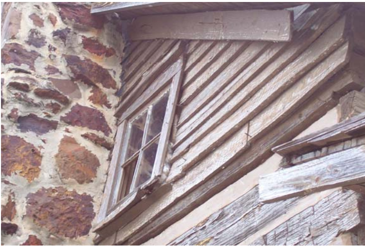
Figure 1.2. The siding on the second story is mismatched to the original log construction and does not fit snugly to the original structure. The window in the picture seems ready to fall out as well.