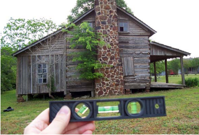
Figure 1.3. The rear addition begins where the vertical siding is located on the left side of the picture. All three areas of modern construction can be seen in this picture; the porch, the second story siding that does not match up, and the rear addition with its vertical siding similar to the material used on the second story.