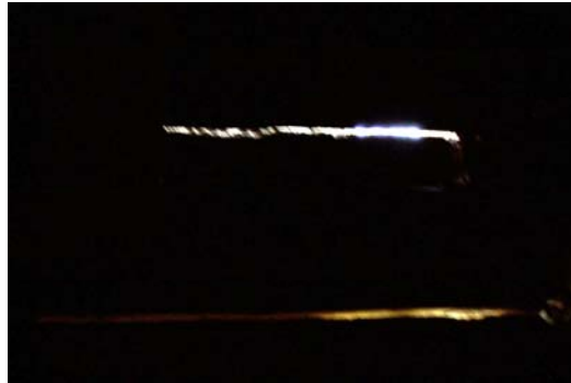
Figure 11.1 shows the concrete daubing used and the wire mesh chinking. This daubing is broken and as seen in figure 11.2 are typical. Many locations are void of daubing material and allow the light to enter the building. Daubing and Chinking require routine maintenance.