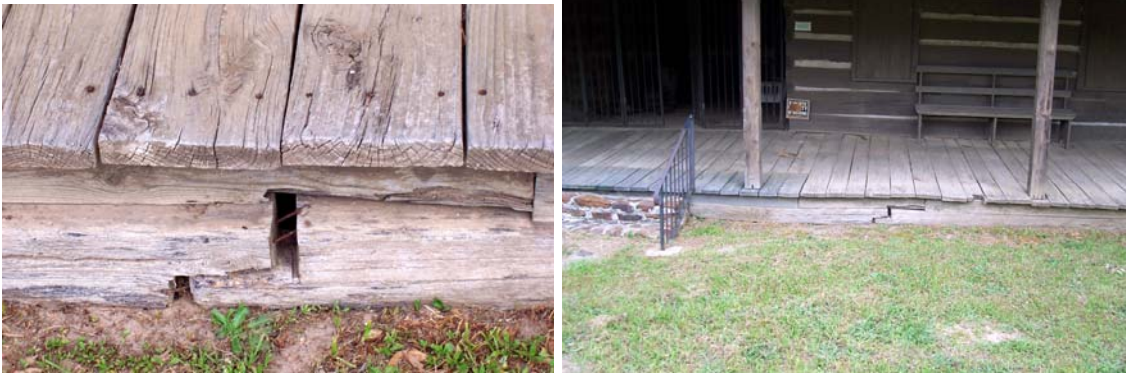
Figure 5.2 and 5.3 show the crack and separation of the front porch's sill.