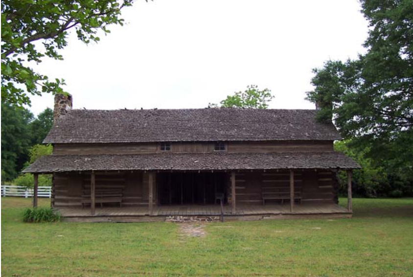
Figure 1.1 shows the Sitton Dogtrot built in 1842. Note the two sides separated by the middle passageway.