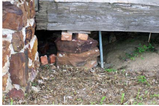
Figures 3.2 and 3.3 show another piece of wood in a precarious position and two red bricks support the weight of the house.