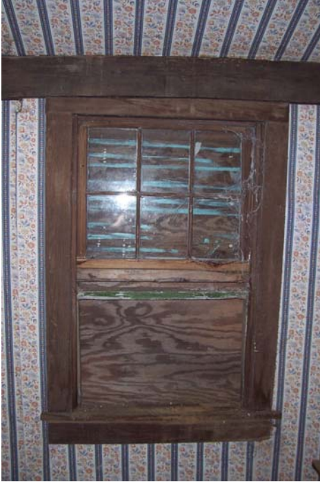
Figure 10.2 shows this window in the east side rear addition is the same style as the one located in the original dogtrot (fig 10.1), but this one's glass is broken. Another window in the west side rear addition is also broken.