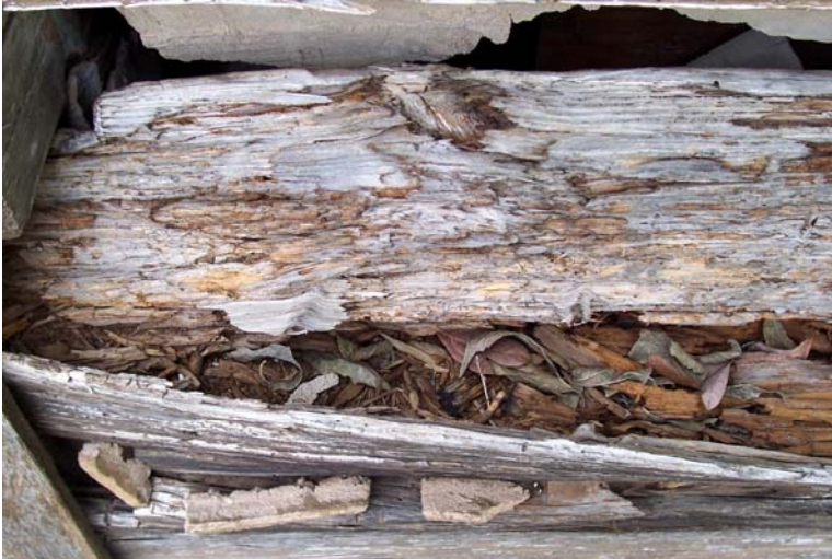
Figure 6.1 shows extensive dry wood termite damage along the west side of the building. This is a rare example, as no other logs are in this poor condition.