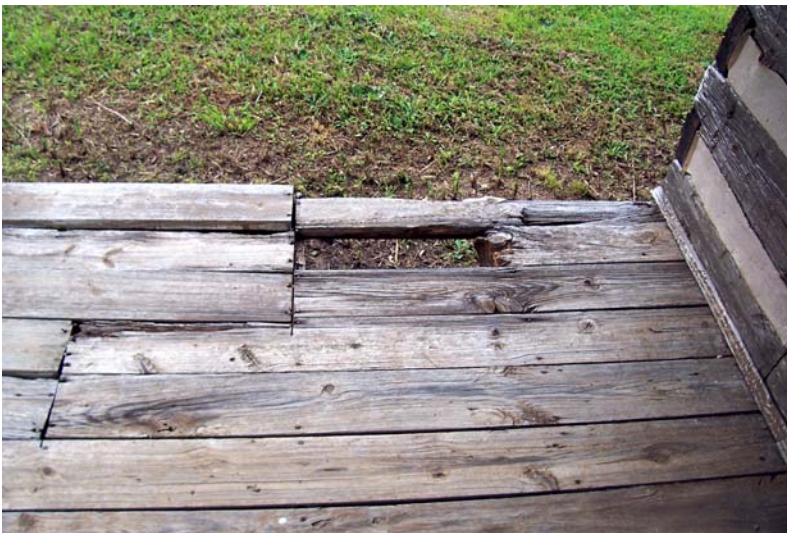
Figure 5.1 shows the deck planks cracked and missing sections. This hole is on the west side of the porch decking.