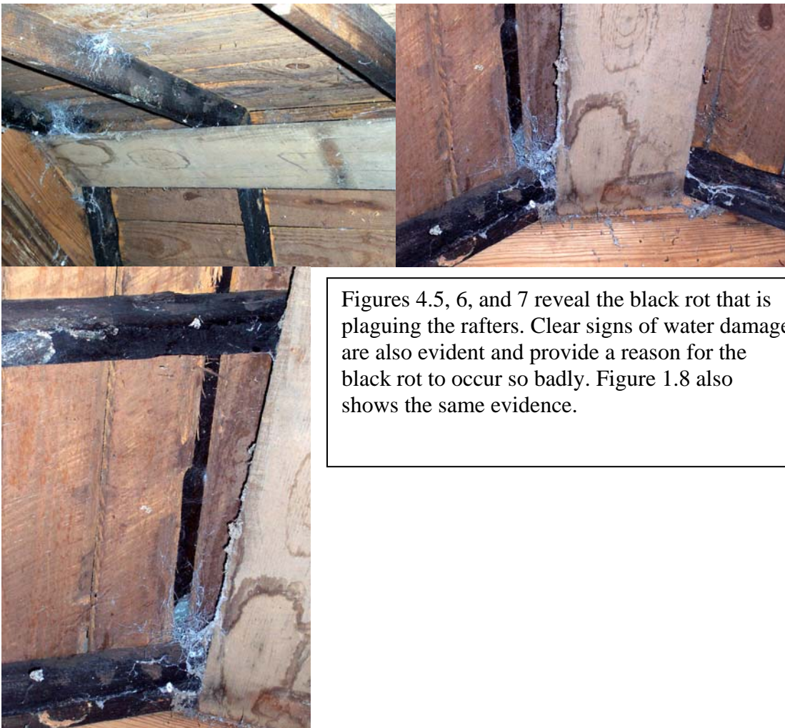
Figures 4.5, 6, and 7 reveal the black rot that is plaguing the rafters. Clear signs of water damage are also evident and provide a reason for the black rot to occur so badly. Figure 1.8 also shows the same evidence.