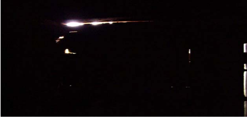
Figure 4.4 reveals the light pouring through the sheathing. This occurs in multiple locations and allows water to penetrate the structure.