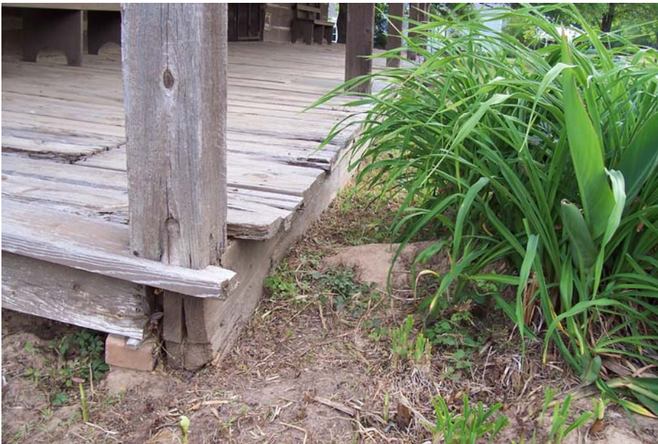
Figure 5.4 shows the modern squared posts, and it also shows the separation of materials along the sill and decking on the western corner of the porch.