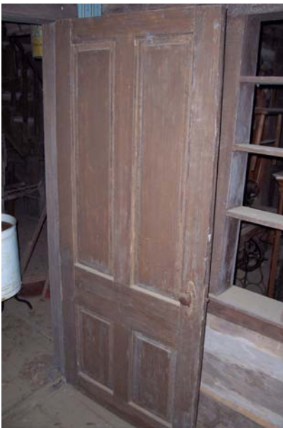
Figure 9.3 shows the modern style door that contrasts greatly with the historic doors on the original section of the house.