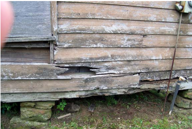
Figure 3.5 shows that the support pillars on the rear addition are leaning to the west side of the building.