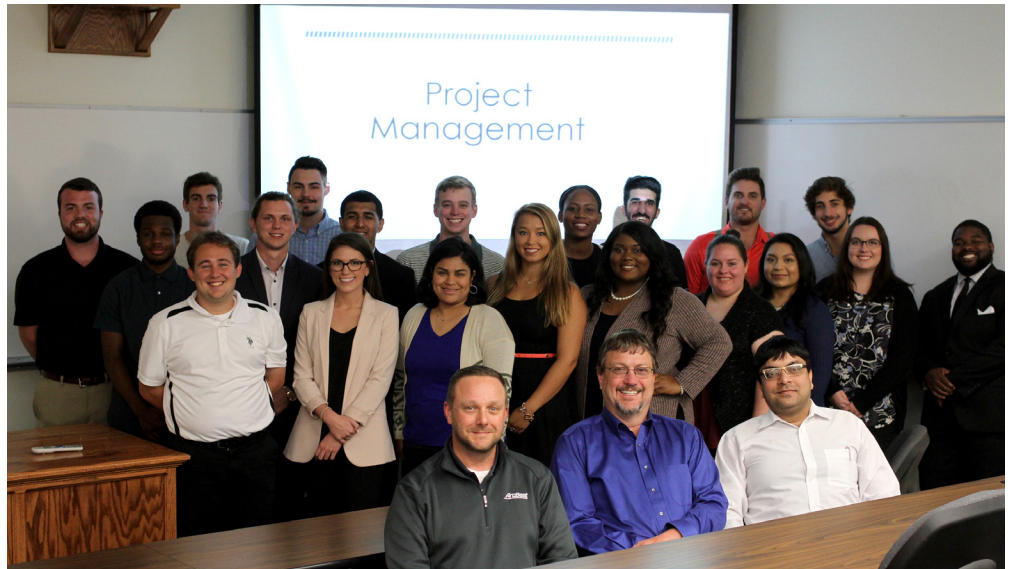
Throughout the spring semester, SFA students enrolled in a project management course in the College of Business engaged in a collaborative project with industry professionals who served as mentors and provided guest lectures.