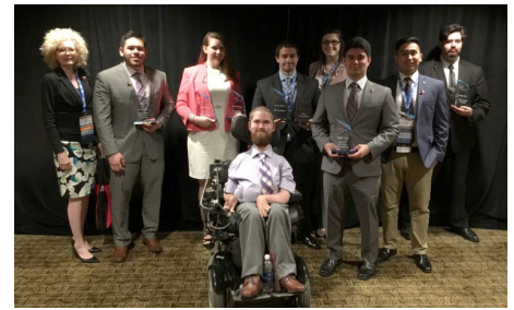
Members of SFA's Phi Beta Lambda chapter placed among the top 10 in various competitions at the National Leadership Conference in Anaheim, California.