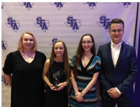
Members of the Economics Reading Group accept the award for student organization of the year.