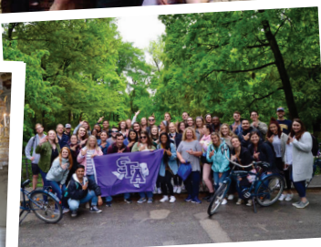
Bike tour, Germany