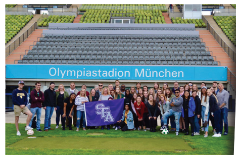
Olympic Park, Germany