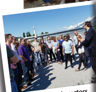
Swarovski Headquarters, Austria