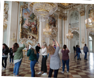
Nymphenburg Palace, Germany